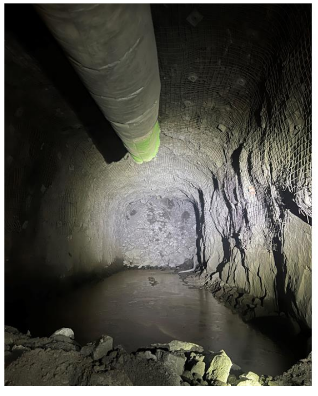
Figure 1 Drawpoint of the first stope (LHS), and close-up showing excellent fragmentation (RHS)